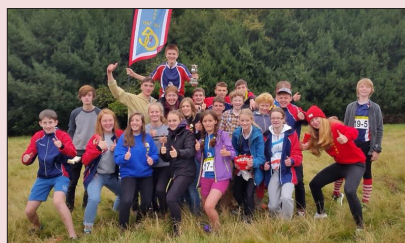
The juniors win the Peter Palmer trophy for the second year in a row. Very impressive.

Retain your answers till the end of the year. Prizes for highest scores.