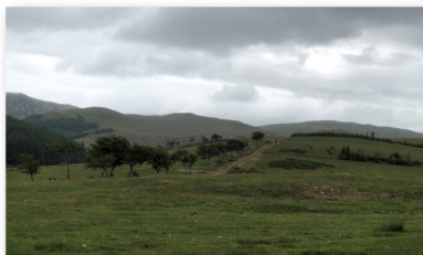
← Looking into Area 1