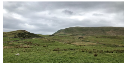
Looking into Area 2 →