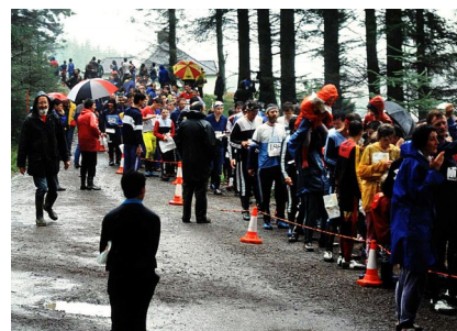
(Relay event at Whinlatter, year unknown)