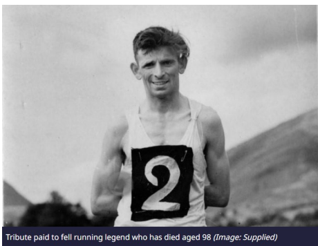
Tribute paid to fell running legend who has died aged 98